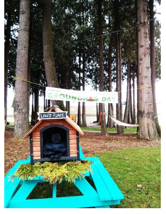
February 1, 2015 Groundhog Day in Newton!